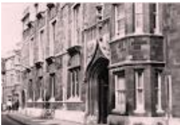
The Original Cavendish Laboratory

Still later Rutherford researched nuclei physics there with its powerful potential.