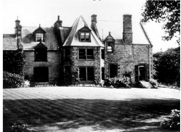
The House at the Glenlair Estate

Britain was falling behind in this scientific field and wished to do something positive about it.