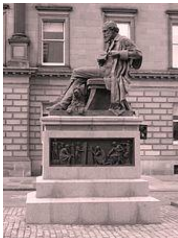
Clerk Maxwell's Statue in Edinburgh

The last named legacy, one could write a book about it alone. Many famous scientists have made their name there, the most notable being the New Zealander Ernest Rutherford, who arrived there in 1919 as Cavendish Professor of Science. He had already made a name for himself at both Manchester and McGill (Canada) Universities being awarded the Nobel Prize for Chemistry in 1908 and splitting the atom using a particle accelerator in 1917. The last 18 years of his life was spent at Cavendish and he left laboratories very contaminated, so much so they were closed for 40 years afterwards, due to the excessive radiation there.