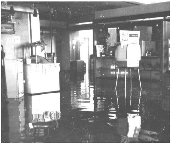
Fig.2 The Showrooms Flooded

While this had been going on, the Service Centre had been cleared of all appliances with thy exception of one cooker and one Deep Freeze Cabinet, which was electrically connected. By this time, the water was 12 ins. deep in the showroom itself and was coming in through the front door from Southgate Street and Dorchester Street. The water in the basement at the time work ceased, was approximately 3 ft deep and it became necessary to isolate the transformers in the basement thus interrupting supplies to the Southgate Street and St. James Parade Area at approximately 10.50 p.m.