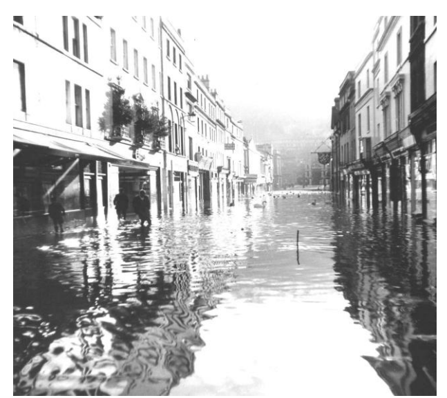
Fig.3 Southgate Street Flooded

Realising that a number of the men and staff had been subjected to very trying times, an emergency canteen was set up at our Lower Borough Walls Service Centre, where hot soup and food was available to them.