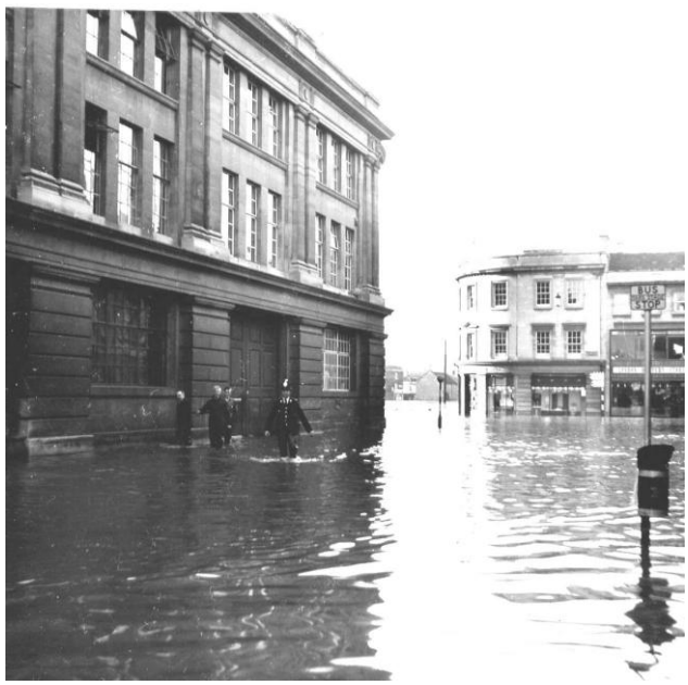
Fig.1 Dorchester Street Offices

Following several days' continuous rain, the river Avon at Bath began to rise and on the afternoon, of Sunday 4<sup>th</sup> December, it had reached a similar level to other floods, which we have experienced in recent years, in as much as the Lower Bristol Road had started to flood and the Broad Quay, which is adjacent to our Offices. Our own building, however, was visited at 4.00 p.m. on that day and was found to be completely dry.